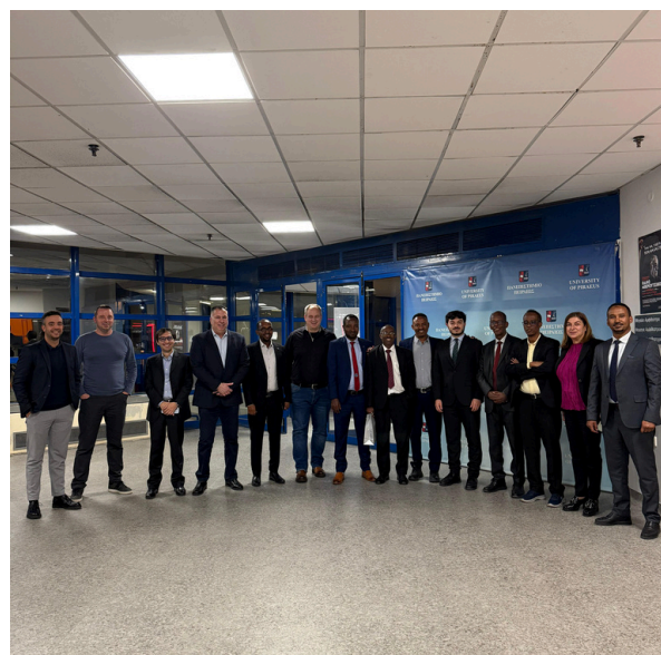
KOM in Greece